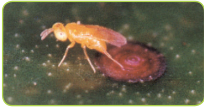
Adult aphytis wasp laying her egg into red scale